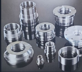
Pistons & Heads