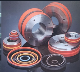
Aftermarket unified Pistons