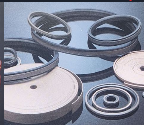
PTFE Seals & Strips