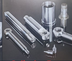
Cylinder Parts Rods & End Caps